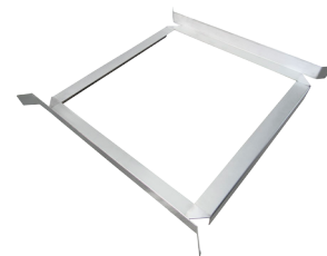
RG Rack Guide