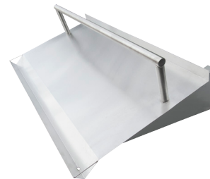
RSW-2 Rack Rest - Tubular