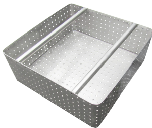
SB Scrap Basket