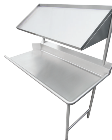
RST Table Mounted Rack Shelf