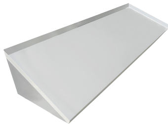
RSW Wall Mounted Rack Shelf