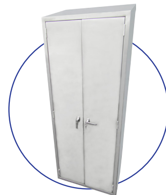
Model #SC-1830HS Shown w/ Solid Double Doors