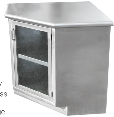
BC-CHG Shown w/ Hinged Glass Door & Rolled Edge