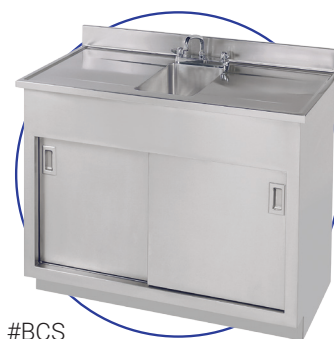
Model #BCS Shown w/ Optional Sink, Faucet & Backsplash