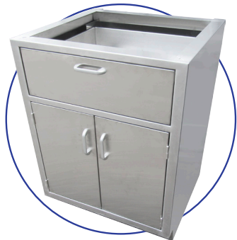
Model #BCH-2426 Shown w/o Countertop & Optional Drawer