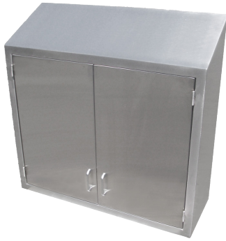
OC-3012HS Shown w/ Hinged Solid Doors & Sloped Top