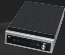
Boxer® Induction Ranges MODEL IRNG-BXC1-18 SHOWN