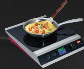
Rapide Cuisine® Induction Ranges MODEL IRNG-PC1-18 SHOWN