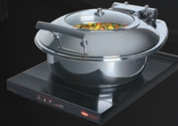
Palletti® Induction Warmers MODEL IWWM-C1-1317-06 SHOWN